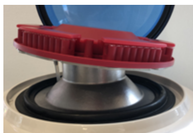
96 well-plate accessories From 8 to 96 wells of 0.3mL Prefilled 96 well-plates available