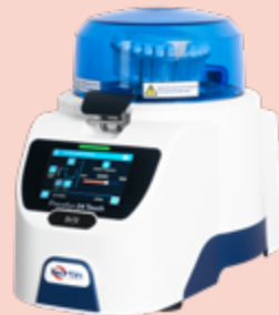
Precellys® 24 Touch Intuitive Tissue Homogenizer