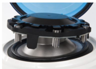
Metal tubes Up to 6 tubes (6mL accessories) Used for very hard samples