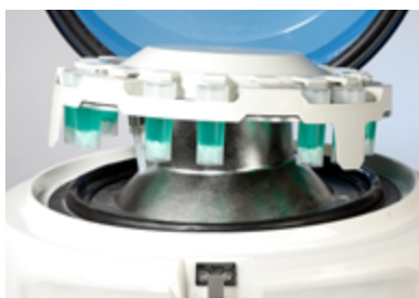
7mL accessories Up to 12 tubes of 7mL