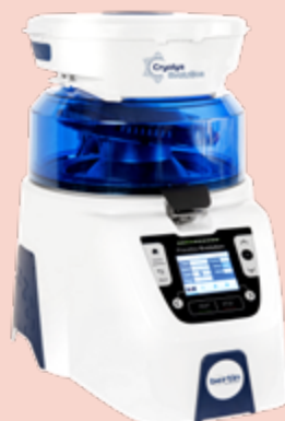
Precellys® Evolution + Cryolyt® Evolution combo