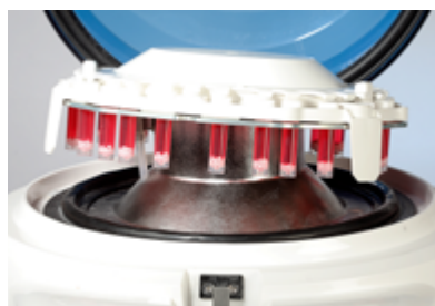
2mL accessories Up to 24 tubes of 2mL (or 0.5mL)