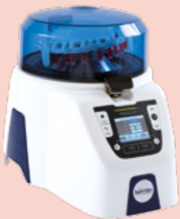
Precellys® Evolution Super Homogenizer