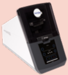
Minilyt® for personal use