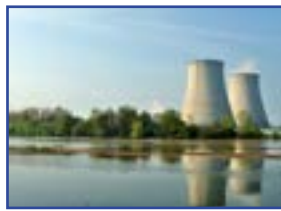
Ring monitoring for nuclear facilities