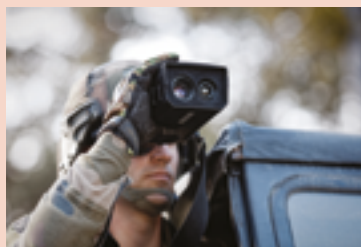
Night & Day Vision Enhancer