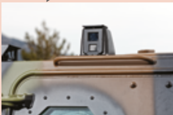
Night & day 360° Land Situational Awareness System