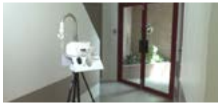
Air sample test