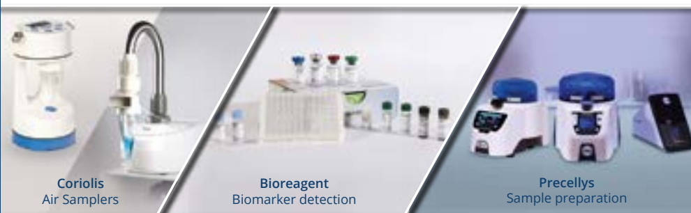
Coriolis Air Samplers