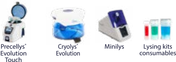
Precellys® Evolution Touch